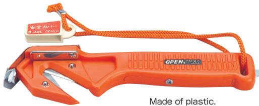
Made of plastic.

Handy cutter for opening of cartons. One set (2 pcs.) of extra blade is stored inside handle.