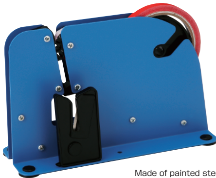
Made of painted steel.