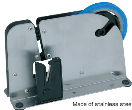
Made of stainless steel.